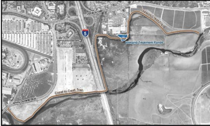
San Diego River Park • Coast to Crest Trail

The San Dieguito River Park has received a $550,017 Proposition 50 grant from the State Water Resources Control Board for the proposed freshwater runoff treatment ponds in the San Dieguito Lagoon.